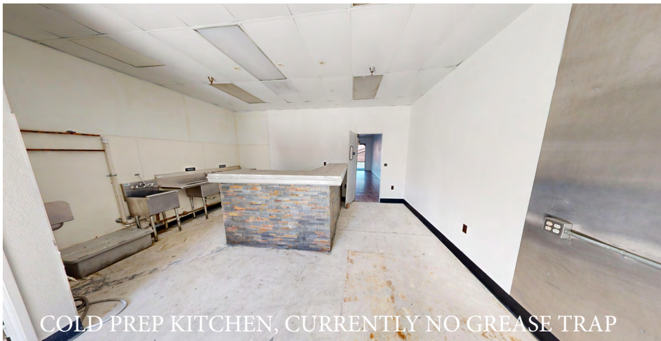
COLD PREP KITCHEN, CURRENTLY NO GREASE TRAP