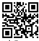
Hatrak Commercial Website